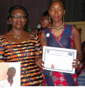
The whole family shares the joy & will benefit from their graduate's success!

Happy graduates dancing into their great celebration day!