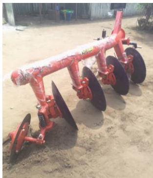
Right: the new plow arrives at the farm.