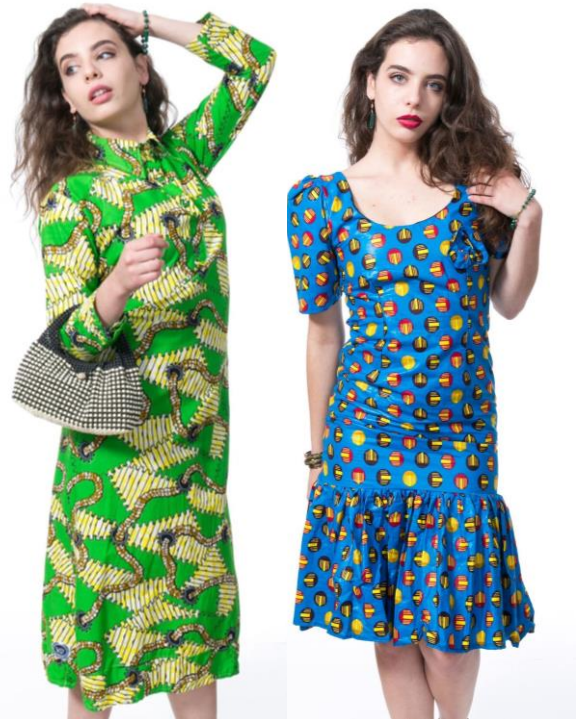
Internationally famous model Luna Serena joins our launch!!

AND we will launch a social media "I Support Woman Cradle of Abundance!" day on Nov. 15! Please join us on your favorite platform & share your care for our sisters & their families in Congo.